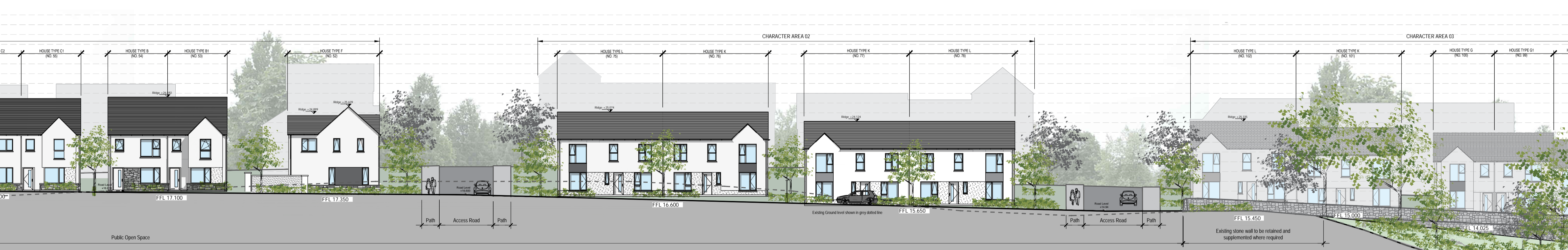
03 Site Context Elevation G-G Part 2 Scale: 1:200