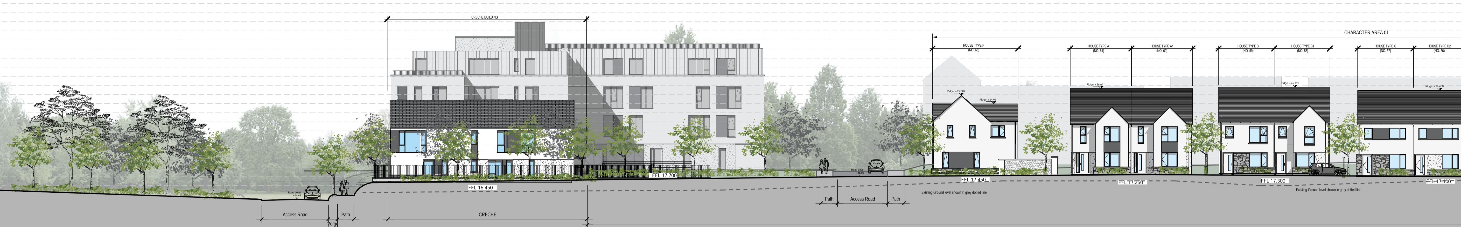
02 Site Context Elevation G-G Part 1 Scale: 1:200