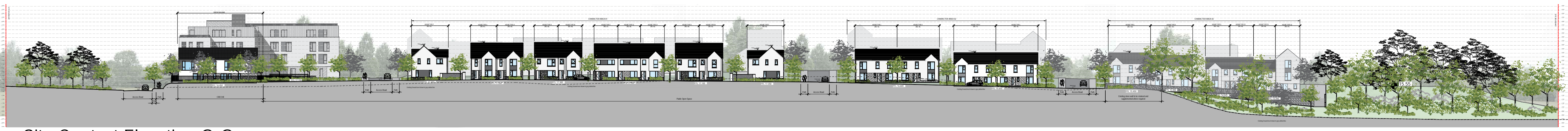
01 Site Context Elevation G-G Scale: 1:500