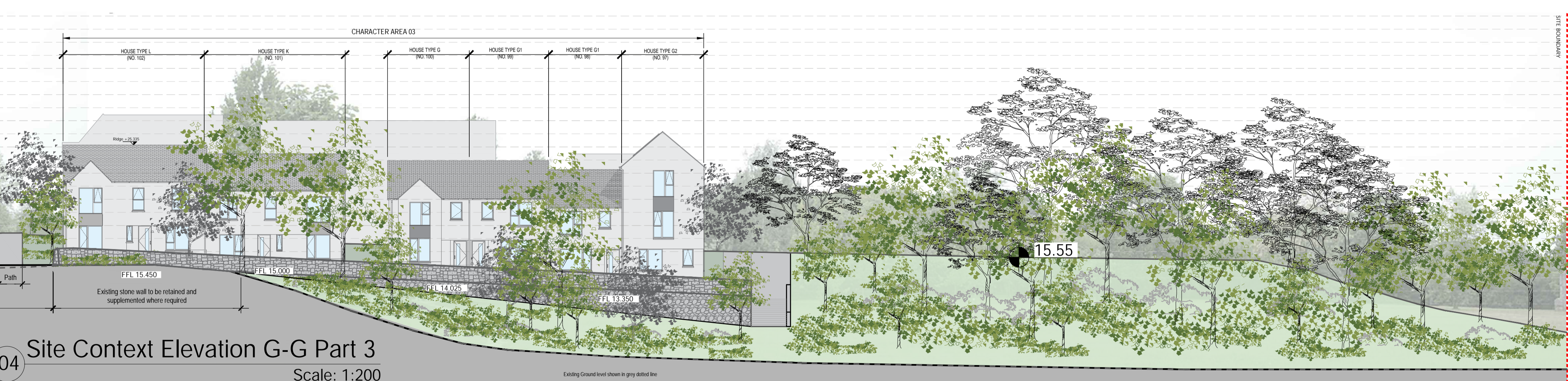
04 Site Context Elevation G-G Part 3 Scale: 1:200